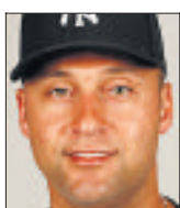
Derek Jeter Yankees, SS 10th All-Star Game