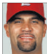
Albert Pujols Cardinals, 1B 8th All-Star Game