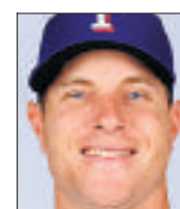
Josh Hamilton Rangers, OF 2nd All-Star Game