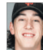
Tim Lincecum Giants, P 2nd All-Star Game