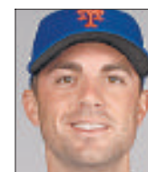
David Wright Mets, 3B 3rd All-Star Game