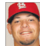
Yadier Molina Cardinals, C 1st All-Star Game