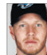
Roy Halladay Blue Jays, P 6th All-Star Game