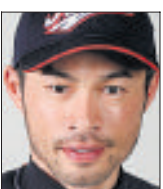
Ichiro Suzuki Mariners, OF 9th All-Star Game