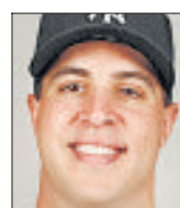
Mark Teixeira Yankees, 1B 2nd All-Star Game