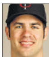
Joe Mauer Twins, C 3rd All-Star Game