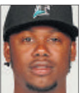
Hanley Ramirez Marlins, SS 2nd All-Star Game