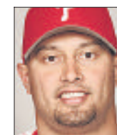
Shane Victorino Phillies, OF 1st All-Star Game