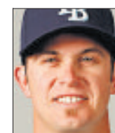
Evan Longoria Rays, 3B 2nd All-Star Game