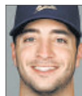
Ryan Braun Brewers, OF 2nd All-Star Game