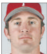
Chase Utley Phillies, 2B 4th All-Star Game