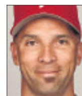
Raul Ibanez Phillies, OF 1st All-Star Game