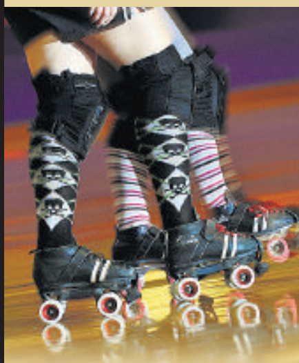
The Detroit Derby Girls practice at Riverside Skating Arena in Livonia.