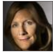
ANGELIQUE S. CHENGELIS

tion in the Big House, smack dab on the 50-yard line — and don't think I've ever taken that for granted.